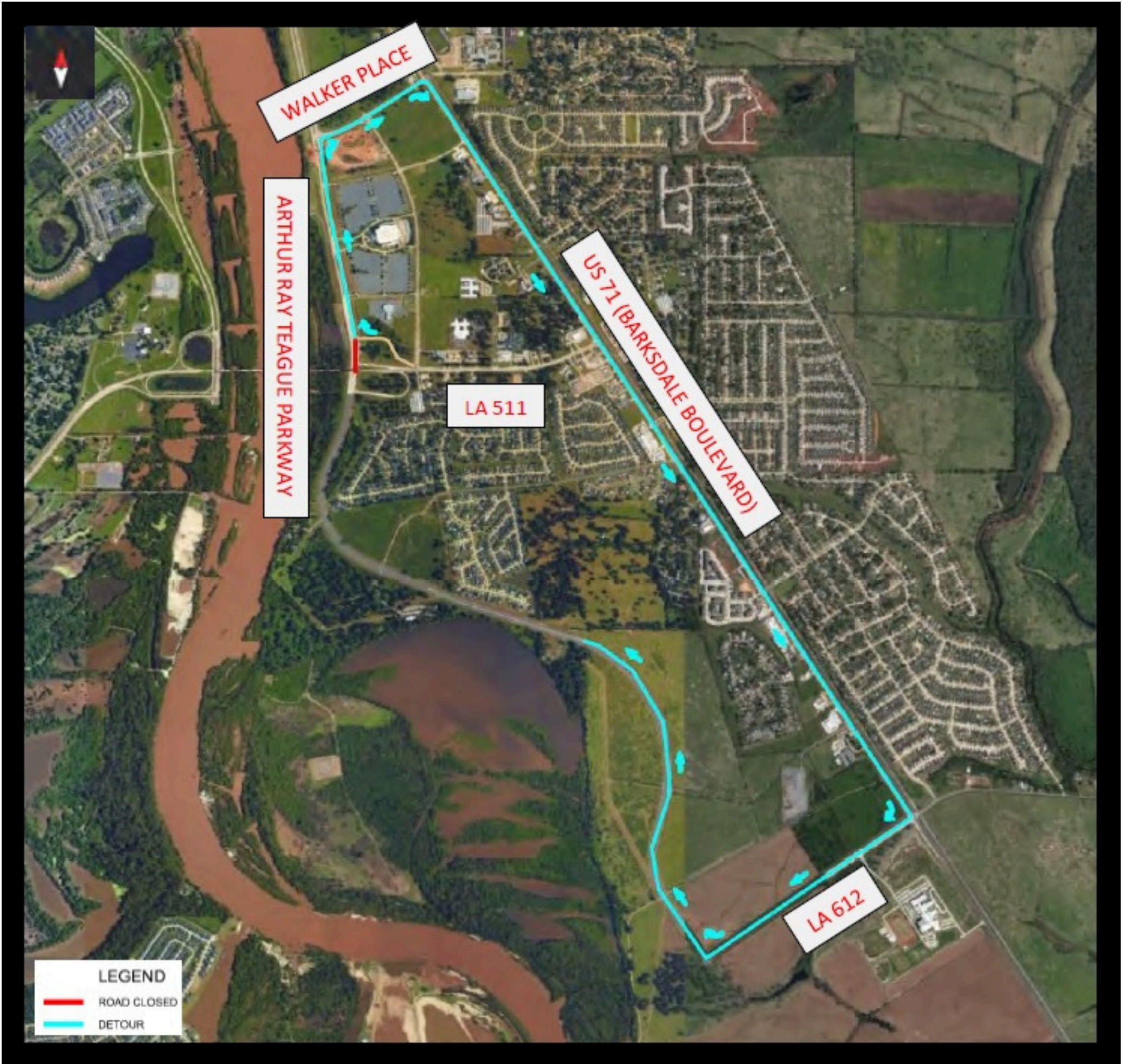
Detour map for Phase 3 nighttime

It is necessary to close Arthur Ray Teague Parkway at night for girder erection over the roadway.