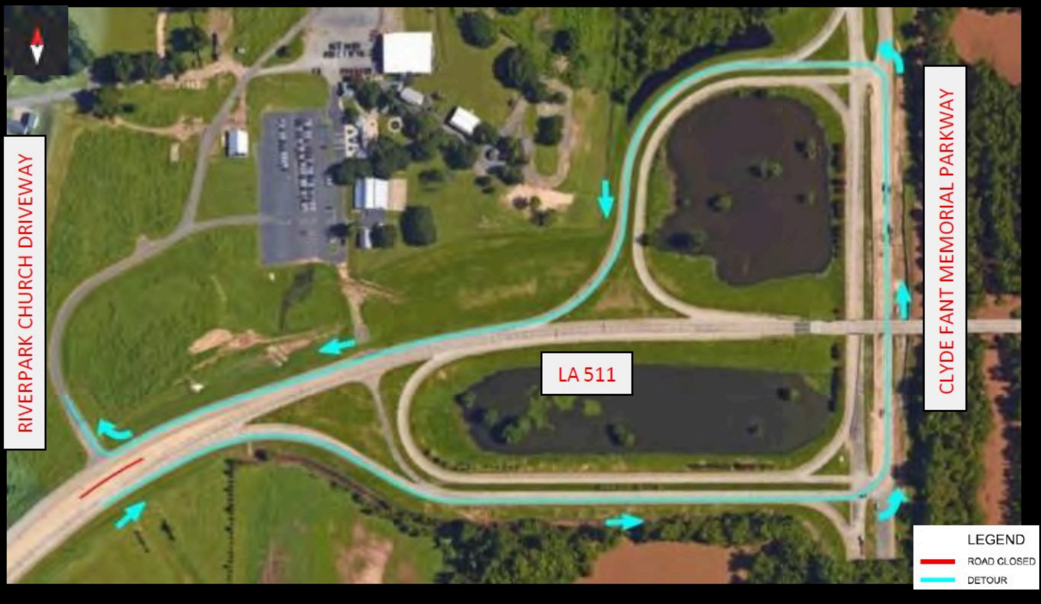
Detour map for Phase 1a, Phase 3 & Phase 3a

It is necessary to close the median so that a new raised median can be constructed at this intersection. Traffic accessing Riverpark Church driveway from eastbound LA 511 will be able to turn left once the raised median is constructed.