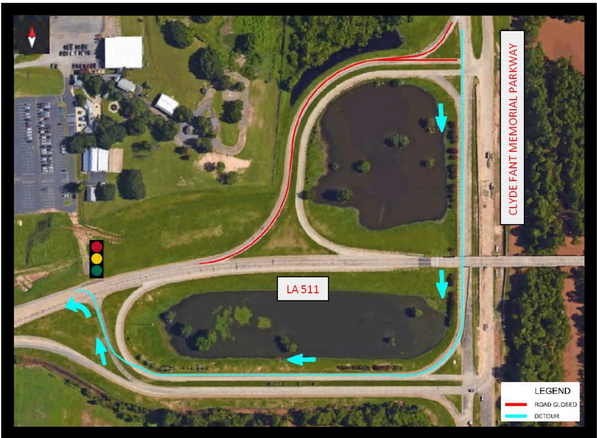
Detour map for Phase 2 and Phase 2a

It is necessary to close the westbound LA 511 ramp so this ramp can be reconstructed to accommodate the new LA 511 roadway alignment.