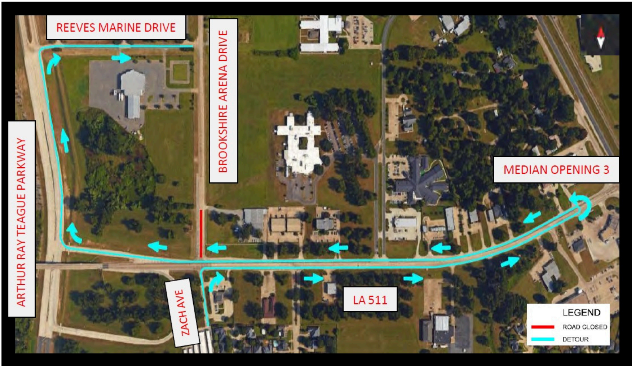
Detour map for Phase 2 and Phase 2a

It is necessary to restrict left turns at Zach Avenue for construction in the median, as this portion of LA 511 is being widened. Southbound traffic on Brookshire Arena Dr. shifts to the right side of the roadway, restricting northbound traffic during these phases.