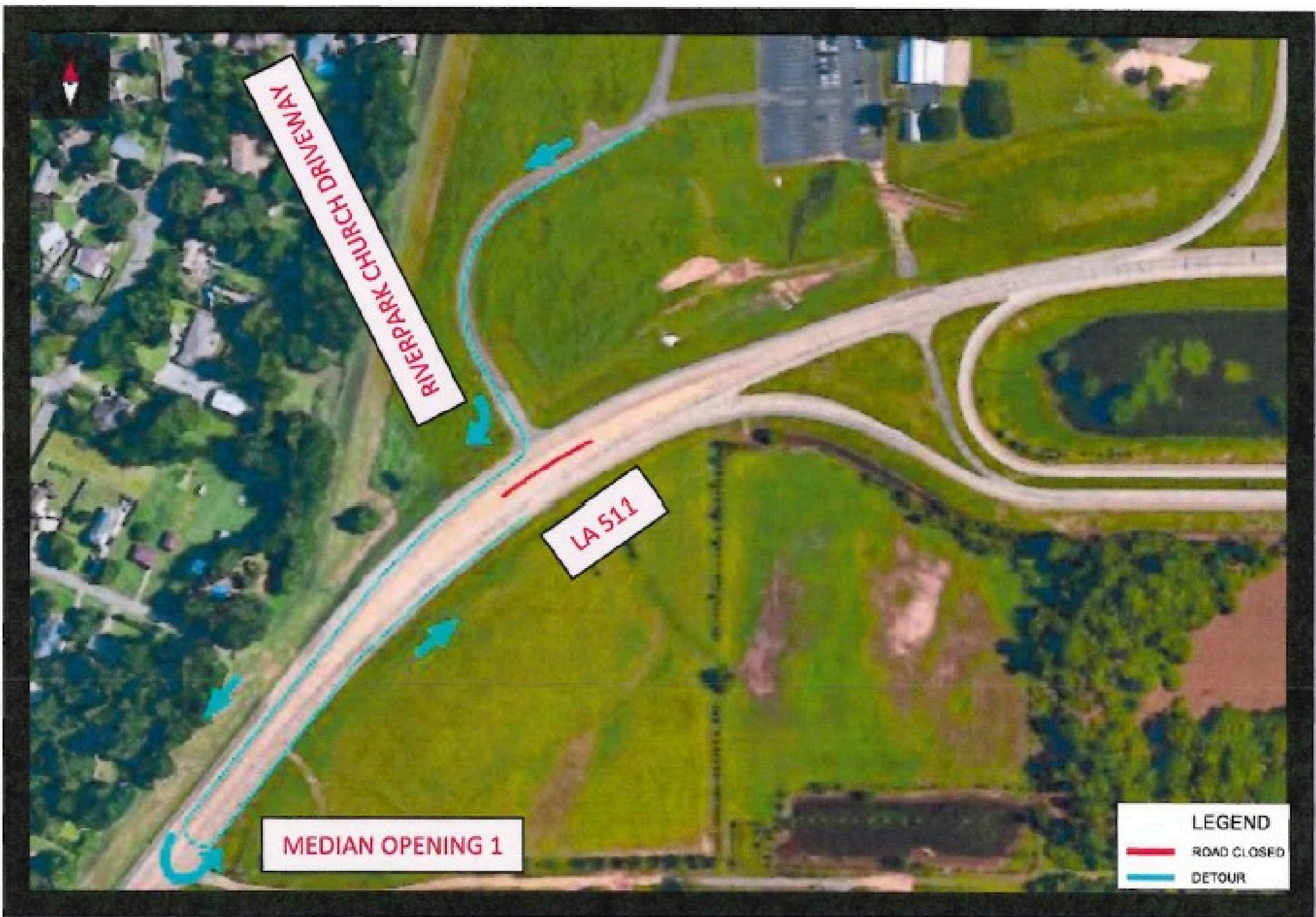
Detour map for Phase 1a & Phase 3a

It is necessary to close the median so that a new raised median can be constructed at this intersection. The new raised median will permanently restrict left turns from Riverpark Church Driveway onto eastbound LA 511, and eastbound traffic will utilize Median Opening 1 as a permanent U-turn location.