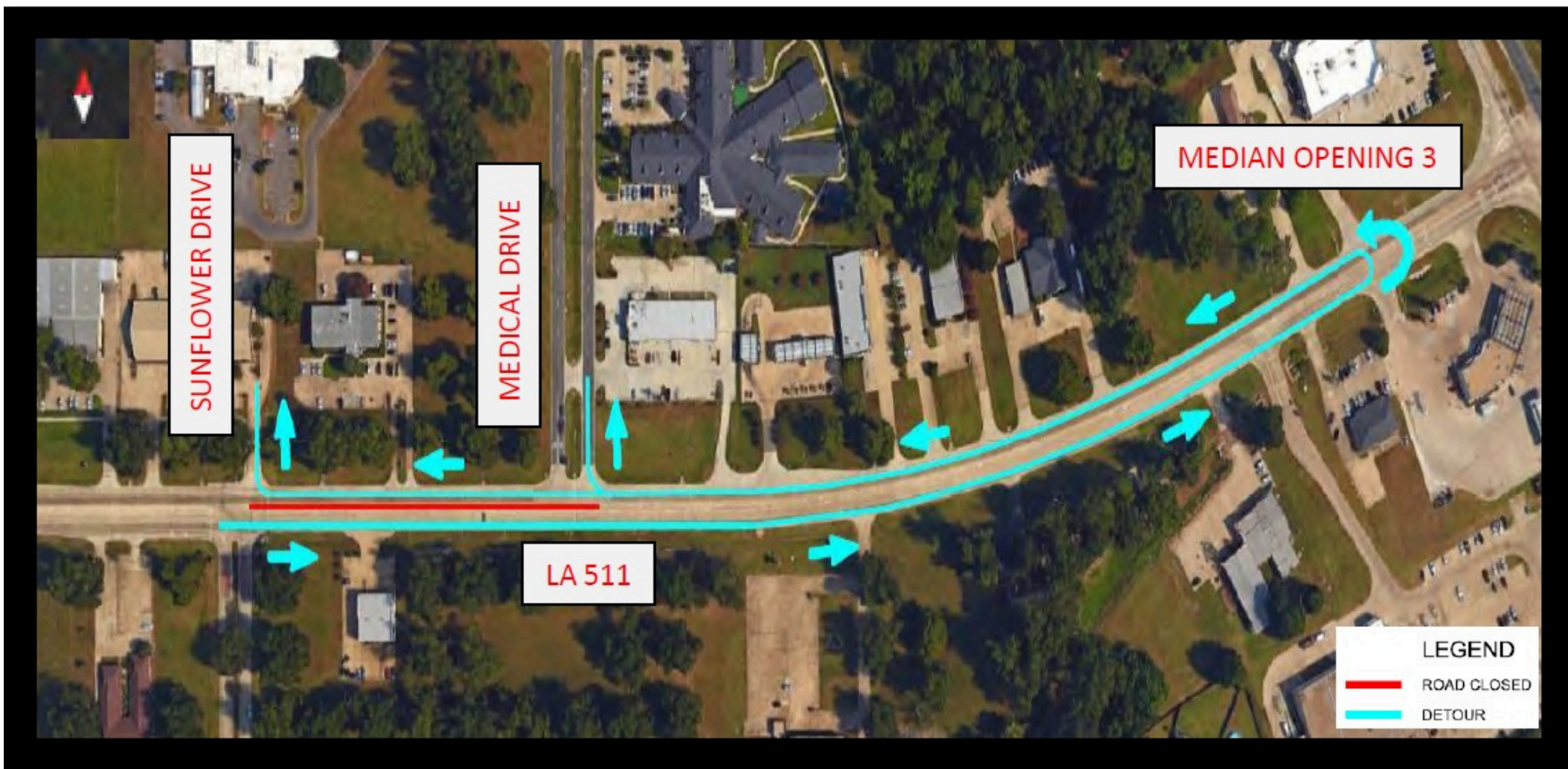
Detour map for Phase 2 and Phase 2a

It is necessary to restrict left turns for construction in the median, as this portion of LA 511 is being widened.